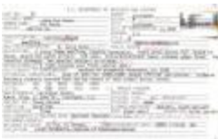
John Fox House (S108042004800366)