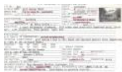
Will George House (S108042004800390)