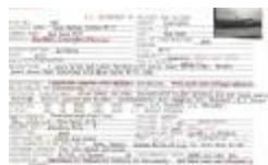
Saxe Goth Cotton Mill (S108042004800396)