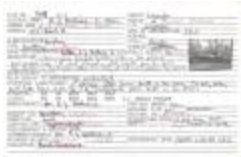
AJ Mathias St House (S108042004800341)