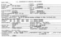
Eli Sox House (S108042004800303)