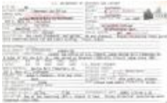
Timmerman Law Office (S108042004800373)