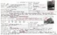
Laurel Falls Factory Site (S108042004800369)