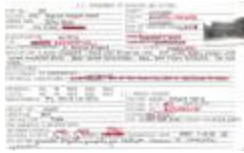
Houston Wingard House (S108042004800323)