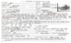
Not Named (S108042004800331)