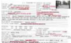
Wise Cotton Gin House (S108042004800334)