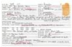
Gus Lorick House (S108042004800345)