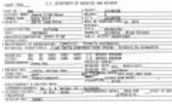
Jennie Sligh House (S108042004800298)