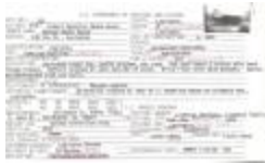
Ernest Hazelius Smoke House (S108042004800325)