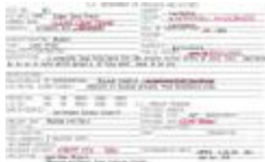
Sugar Cane Press (S108042004800335)