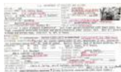
CE Corley House (S108042004800392)