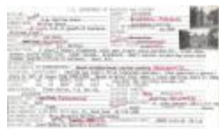
AL Hartley House (S108042004800391)