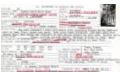
Simmons-Harth-Gantt House (S108042004800367)