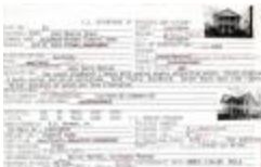
John Meetze House (S108042004800371)