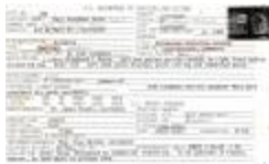
Mary Caughman House (S108042004800338)