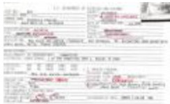
Not Named (S108042004800380)