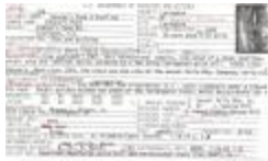
George's Ponf & Pavilion (S108042004800382)