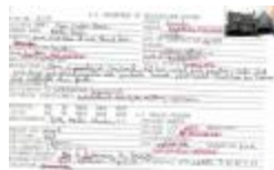
Jess Taylor House (S108042004800386)