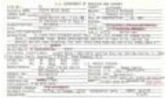
Joseph Neese House (S108042004800362)