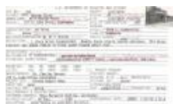
George Store (S108042004800389)