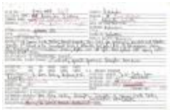
Lexington Quarry (S108042004800351)