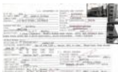
Kit Hendrix Cottage (S108042004800385)