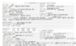
Martin Shull House (S108042004800399)