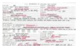
Levi Gunter House (S108042004800398)