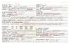
Raul-Regen House (S108042004800358)