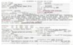
Seay Dairy (S108042004800326)