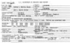
Andrew J Mathias House (S108042004800350)