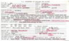
WQM Berly House (S108042004800317)