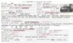
Maj. Henr Meetze House (S108042004800374)