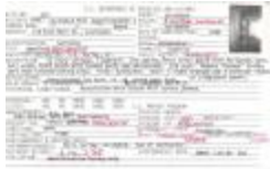
Lexington Mill Superintendent's House (S108042004800377)