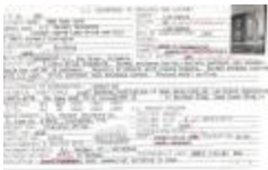
Home Bank (S108042004800319)