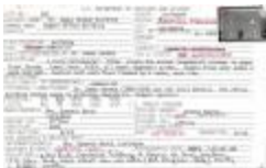
Dr James Harmon Building (S108042004800320)