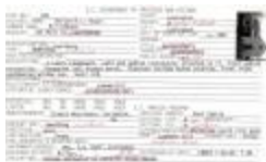
Belton-Roof House (S108042004800339)