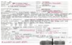
Lexington School (S108042004800318)