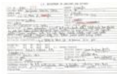
Caughman-Kaniner Store (S108042004800355)