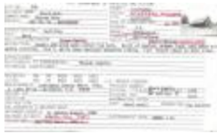
Stack Barn (S108042004800330)