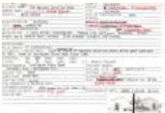
Old Western Carolina Bank (S108042004800321)