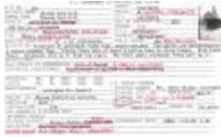
Vassey Corn Crib (S108042004800329)