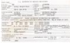
Quincy Wingard House (S108042004800296)