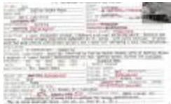
Godfrey Harman House (S108042004800381)