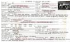
Not Named (S108042004800370)