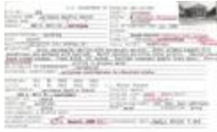
Lexington Baptist Church (S108042004800378)