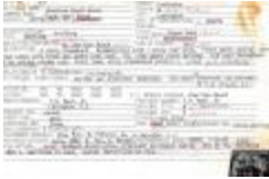
Charlton Rauch House (S108042004800315)