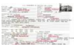
WA Harmon House (S108042004800340)