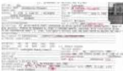
Confederate Monument (S108042004800322)