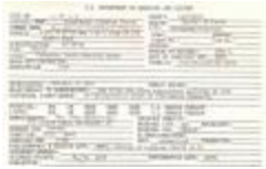
Providence Lutheran Church (S108042004800359)