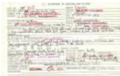
Lexington County Jail (S108042004800354)