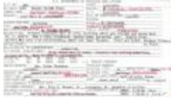
Reuben Harmon House (S108042004800379)