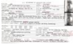
Lorcik-Derrick Log Cabin (S108042004800328)