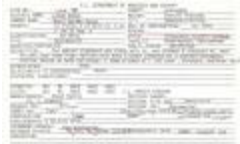
Laird House (S108042004800361)