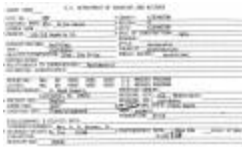
Price House (S108042004800304)