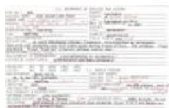
John Joseph Lown House (S108042004800395)