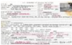
Lexington Manufacturing Co (S108042004800376)