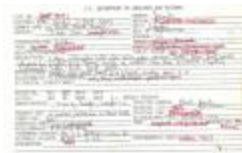
Belton D Clark House (S108042004800356)