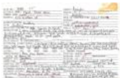
Efird-Barre House (S108042004800346)