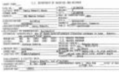
Harry Roberts House (S108042004800297)