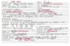
Maggie Derrick House (S108042004800343)