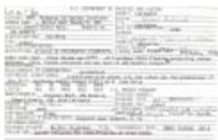
Palmetto Collegiate Institute (S108042004800384)