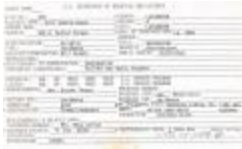
Bill Steele House (S108042004800314)