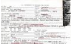
Not Named (S108042004800316)