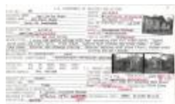
Joel Corley House (S108042004800393)