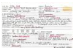
Recken David Harsman House (S108042004800348)