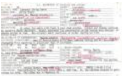
Lawrence Corley Cabin (S108042004800365)