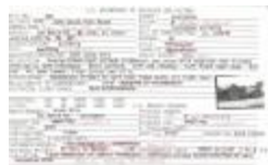
John Jacob Hite House (S108042004800394)