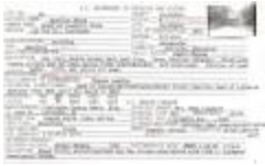
Hazelius House (S108042004800368)