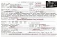
Pickens Roof House (S108042004800375)