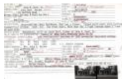
John M Roof Sr House (S108042004800400)