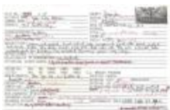
Joe Sox House (S108042004800349)