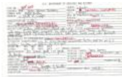
James Hannon Building (S108042004800357)