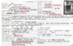
Taylor Dairy (S108042004800324)