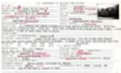
Stewart's Corner (S108042004800372)