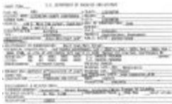
Lexington County Courthouse (S108042004800299)