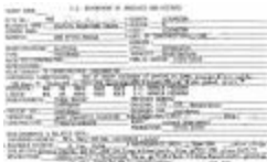
Charles Bauknight House (S108042004800301)