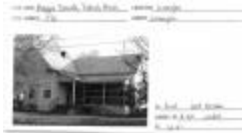
Maggie Derrick Roberts House (S108042004800352)