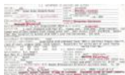
Simon Peter Wingard House (S108042004800387)