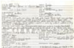
Issac O Summers House (S108042004800364)