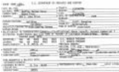
Godfrey Harman House (S108042004800360)