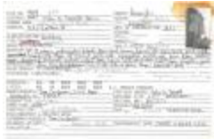
John D Carroll House (S108042004800342)