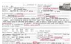
Boozer Tavern (S108042004800397)