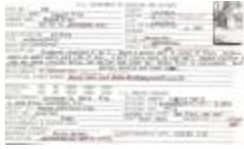
Luquire Privy (S108042004800332)